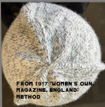
FROM 1917 'WOMEN'S OWN' MAGAZINE, ENGLAND: METHOD