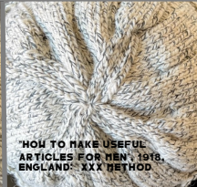
'HOW TO MAKE USEFUL ARTICLES FOR MEN', 1918, ENGLAND: XXX METHOD