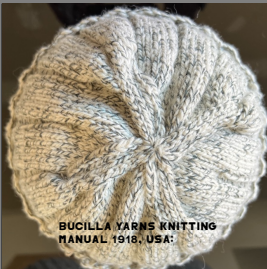
BUCILLA YARNS KNITTING MANUAL 1918, USA: