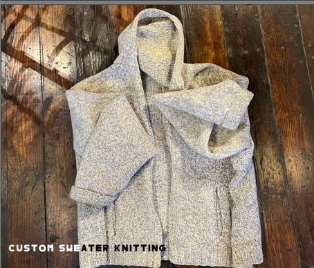
CUSTOM SWEATER KNITTING

AUTHENTIC NATURAL WOOL GENUINE KNITTING SUBSTANTIAL QUALITY